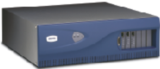
SonicWALL GX Series

In addition to high-performance VPN connectivity and integrated security, the GX250 and GX650 support the comprehensive portfolio of SonicWALL Security Services, including Network Anti-Virus, Content Filtering, and Authentication Service.